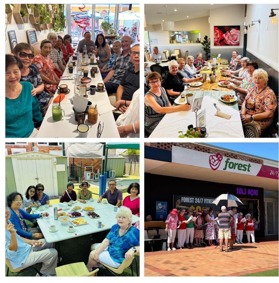
Meetings and Carols in the Centre during December 2024

Throughout 2025 carry the lessons of Advent with you