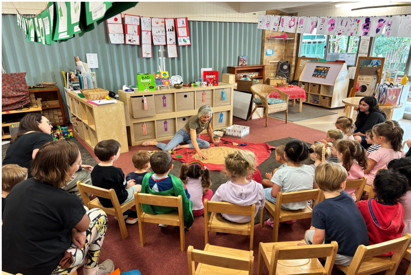
< Godly Play @ Preschool for the Easter Season >