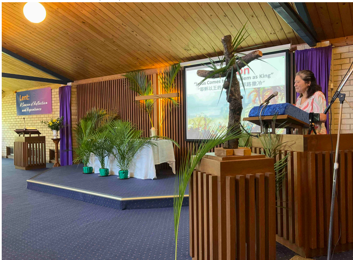
< 2025 Palm Sunday >